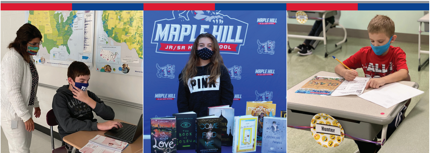
Whether students are learning in-person or virtually, they have put in a tremendous amount of work this year.