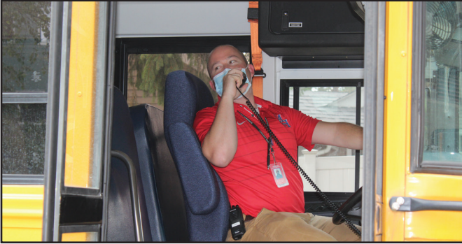
The District needs to replace 1 large bus and 1 small wheelchair accessible bus. Note: Principal Derby not included

As part of the District's long-term bus replacement program, a proposition on the May 18 ballot would allow the District to purchase one 65-passenger bus and one small wheelchair accessible bus.